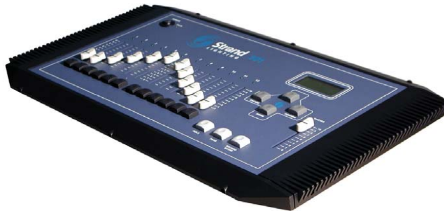
301backup Lighting Control Console

The 301 console is a versatile multifunction console that may be used as a backup to any DMX512 lighting system and as a manual desk. It may also be used as a timed event controller.