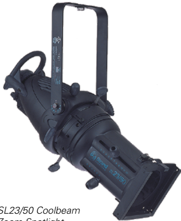
SL23/50 Coolbeam Zoom Spotlight