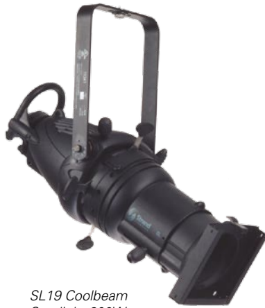
SL19 Coolbeam Spotlight 600W