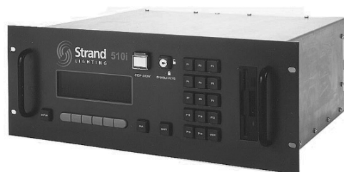
510i Show Controller System