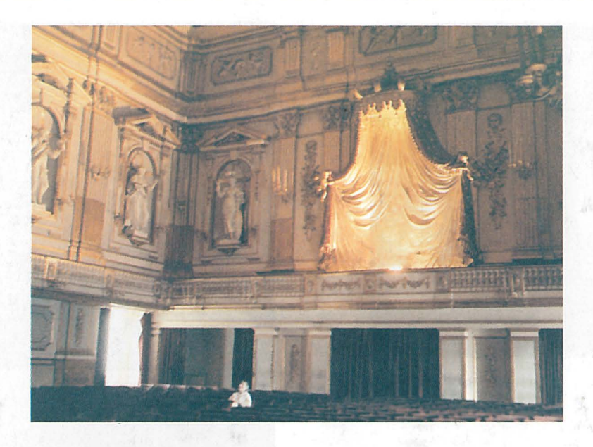
Teatro di Corte in the Palazzo Reale, Naples