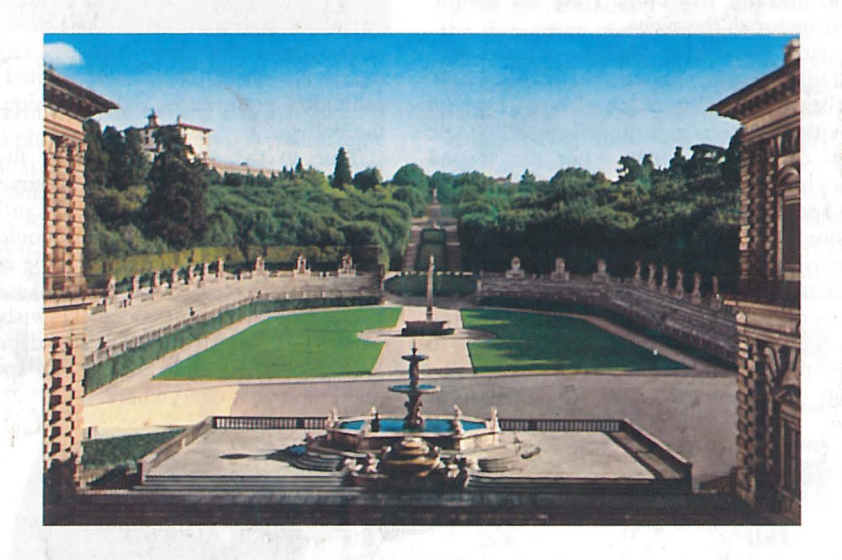
Anfiteatro di Boboli beside the Pitti Palace, Florence