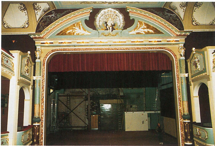
Redecorated proscenium restored to full height.

Proscenium rear wall from new P.Fly gallery. Rendered cement line sloping down from cable duct shows original roof line.