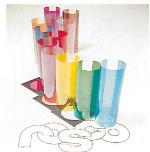
Rosco Supergel colour filters are available in over 80 colours in sheet or roll form.

For further information and the latest price list speak to Crown House Furse Theatre Products, the newly appointed Rosco distributors in the East Midlands.