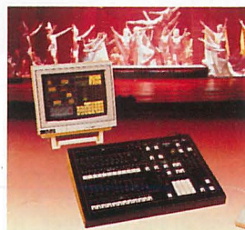
The ADB S20 theatre lighting control desk and colour monitor.

Retailing from £2750.00 the S20 represents a real breakthrough in sophisticated theatre lighting control.