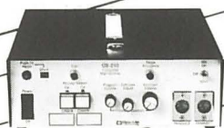
CS-210 2 Channel Main Station