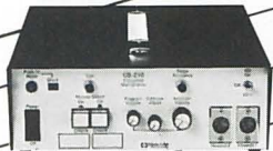
CS-210 2-Channel Main Station