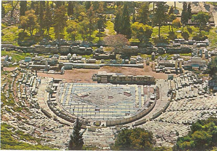
Theatre of Dionysus