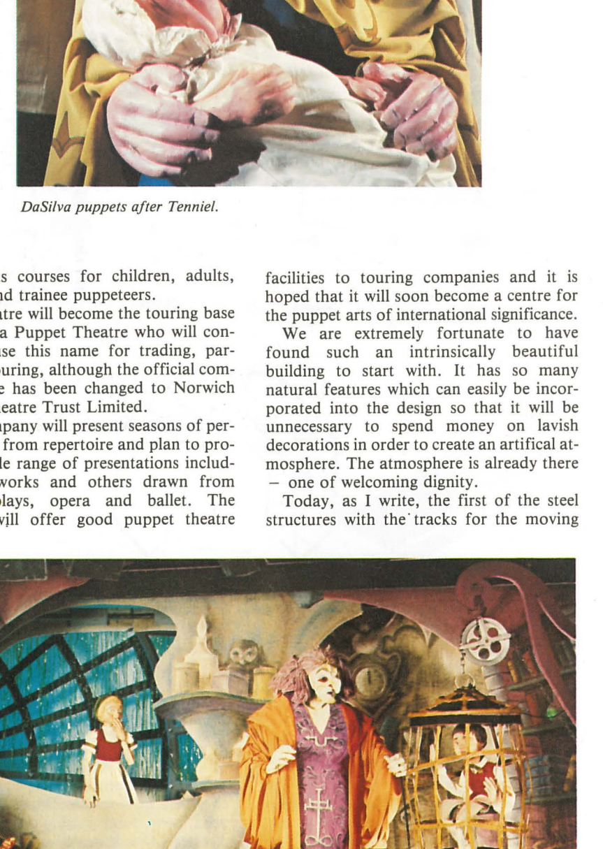
Hansel and Gretel.

Meanwhile, the Manpower Services Commission are delighted with the success of the project from their point of view and have agreed to an extension of the scheme for a further three months. Jobs for the youngsters have been given as much priority as getting the theatre built and, so far, the scheme has enabled seventeen youngsters to leave and take up permanent employment.