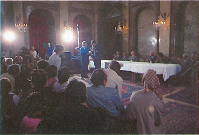
The prize giving ceremony was held in The Great Hall of the Waldstein Palace.